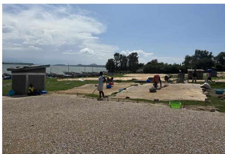
Figure 4 Women drying silver fish (daga) in Rarieda, Siaya, Lake Victoria, Kenya

For this analysis, a distributional and gender analysis has not been undertaken. However, there are specific groups that are targeted that are relevant. For example, there are many females employed in fish drying and processing, especially in handling the largest fish catch – daga as shown on Figure 4, which is dried in the sun, a job done exclusively by women. Furthermore, many females are boat owners shown in Figure 5.