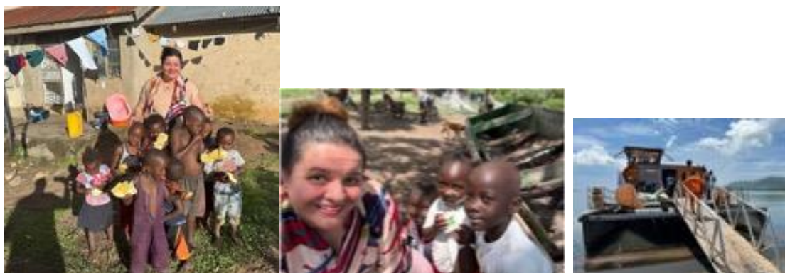
Figure 6 Children, together with the women are one of the most vulnerable populations on Lake Victoria

(Photo left: Kalangala, Sesse Islands, Uganda; Photo middle: Siaya landing site Rarieda, Kenya, Photo right: Passengers climbing the Ferry Boat in Homa Bay, Kenya)