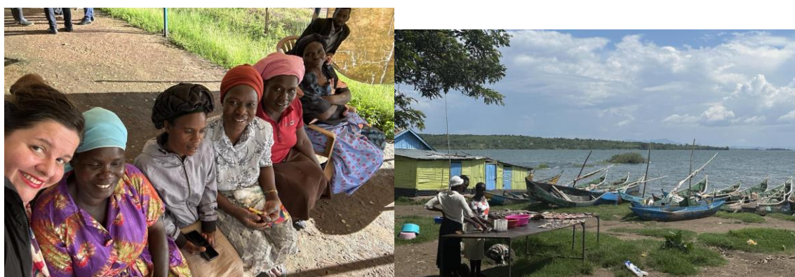
Figure 5 Women boat owners and fish traders in Kalangala, Ssesse Islands, Lake Victoria, Uganda

There were also great benefits to small boat travelers, i.e., the lake island population, which regularly include altogether men, women and children shown in Figure 6, and have also included lower income groups (than the mainland in the respective countries).