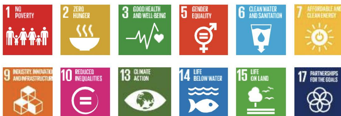
Figure 2 DFID's contribution under SO2: Strengthen Resilience and Response to Crises for the Global Sustainable Development Goals (SDGs) 10

UK's science and technology work, in the case of HIGHWAY through the UK Met Office supporting WMO to implement HIGHWAY, has a strong focus on responding swiftly, flexibly, and generously to help people at the most difficult times in their lives, and to ensure a more effective global response to crises and disasters by the international system by improving the anticipation and management of risk. As can be seen in Figure 2, DFID's work under SO2 has contributed to the following Global Sustainable Development Goals (SDGs): SDG 1: No Poverty, SDG 2: Zero Hunger, SDG 3 Good Health and Well-being, SDG 5: Gender Equality, SDG 6: Clean Water and Sanitation, SDG 7: Affordable and Clean Energy, SDG 9: Industry, Innovation and Infrastructure, SDG 10: Reduced Inequalities, SDG 13: Climate Action, SDG 14: Life below Water, SDG 15: Life on Land, and SDG 17: Partnership for the Goals, amongst others.