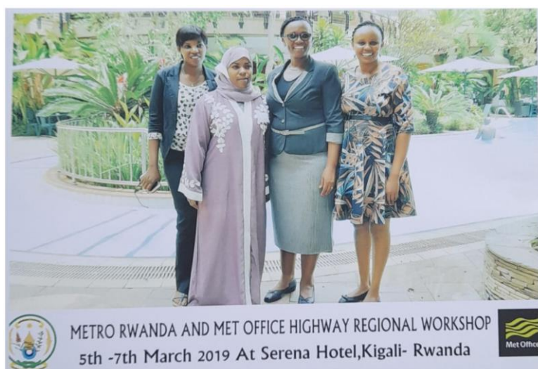
Figure 3 Women participation in the Météo Rwanda and Met Office HIGHWAY Regional Workshop

Gender was not considered in the project and there were no gender-disaggregated indicators neither in the project's logical framework nor in the monitoring, evaluation, and learning reports and the climate resilience studies. The trainings list did not include disaggregated information on the gender of its participants; however, women were regularly present at diverse NMHSs trainings. As demonstrated in Figure 3, women from the four EAC countries were regular participants in the trainings. It has to be noted that out of 560 employees at the Tanzanian Meteorological Authority (TMA), 160 are women, making them almost 30% of all employees.